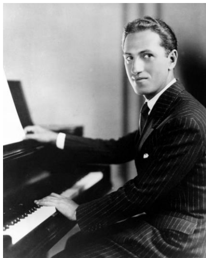
George Gershwin Composer, Who Cares?

George Gershwin is an American composer and pianist whose compositions spanned both popular and classical genres.