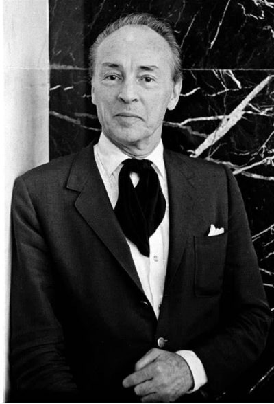
George Balanchine Choreographer, Who Cares?

George Balanchine is known as “The father of American ballet.”